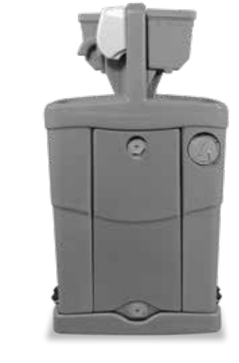
Lift Kit (optional)